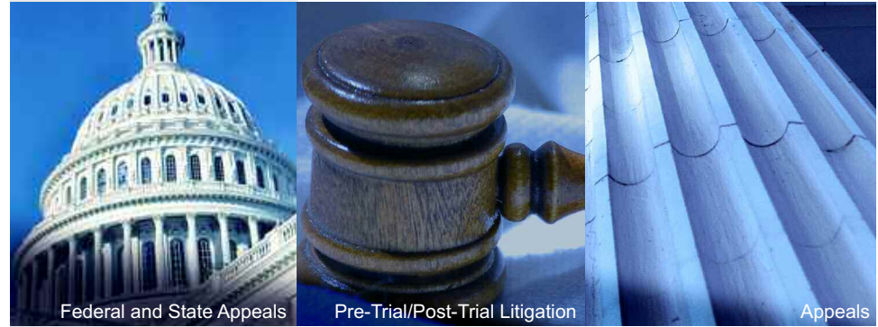
Federal and State Appeals